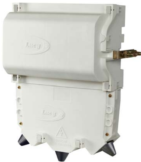
HDC200 c/w Cable Trough