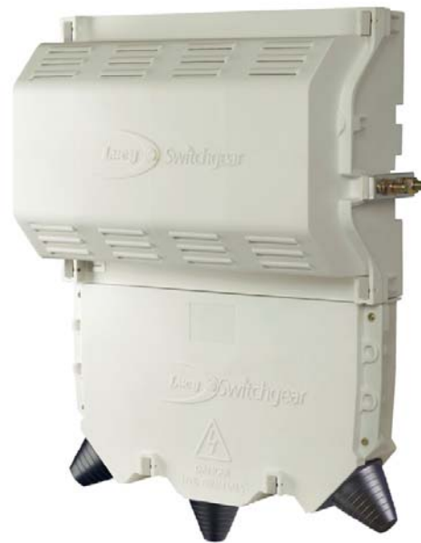
HDC400 c/w Cable Trough